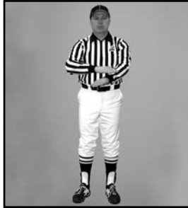
RESETTING THE 20-SECOND CLOCK a stroking motion of the forearm