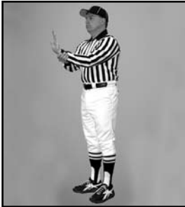
ILLEGAL BLOCK arm extended & grasp wrist