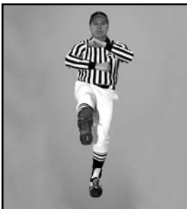
ILLEGAL KICKOFF hands rolling in forward motion followed by swinging leg