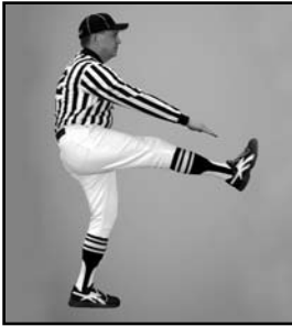
CONTACTING THE KICKER touch raised leg below knee