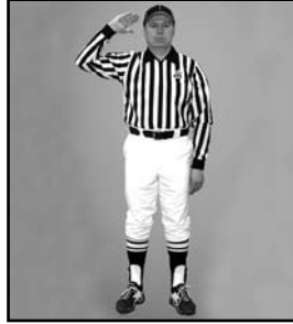
ROUGHING THE PASSER passing motion