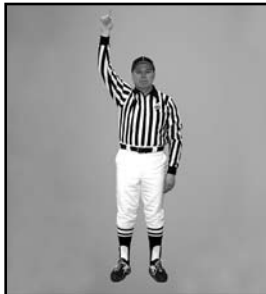
SINGLE POINT one arm extended above head & indicating 1 point