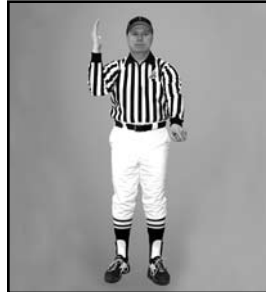
INTENTIONAL GROUNDING passing motion & pointing at ground