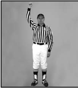
FORWARD PASS BEHIND LINE OF SCRIMMAGE raise arm above head