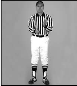
PILING ON vertical chopping motion with both hands