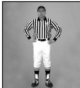
OFFSIDE hands on hips