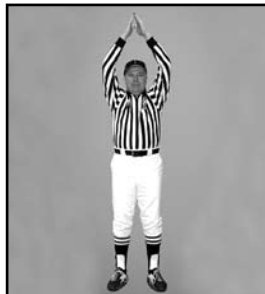
SAFETY TOUCH palms together above head