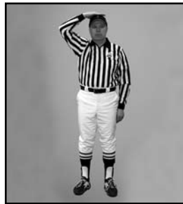
ILLEGAL SUBSTITUTION one hand on top of head