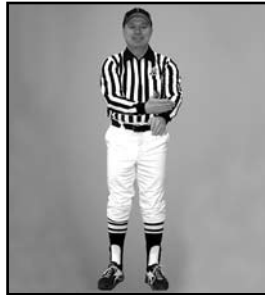
DISQUALIFICATION chopping action on wrist