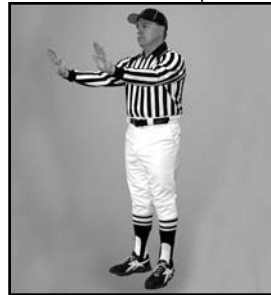
ILLEGAL INTERFERENCE pushing arms forward from shoulders