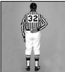
OBJECTIONABLE CONDUCT one hand behind back