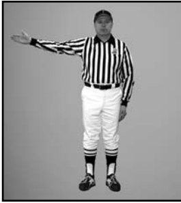
ONSIDE OR LATERAL PASS pointing in the direction the ball was thrown