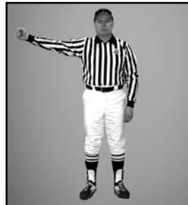
UNNECESSARY ROUGHNESS pumping motion of arm sideways