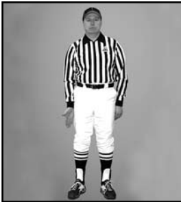
ILLEGAL CRACKBACK striking thigh with open hand