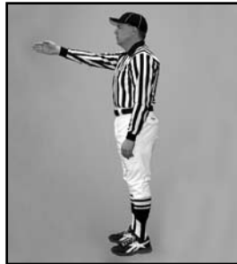
FIRST DOWN AWARDED arm pointed forward