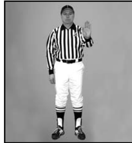
ILLEGAL CONTACT ON A RECEIVER one arm extended with open hand