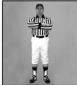
NO YARDS arms folded at chest