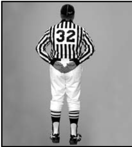
DELAY OF GAME both hands behind back