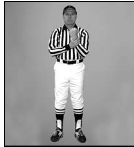
HOLDING grasping wrist at chest level