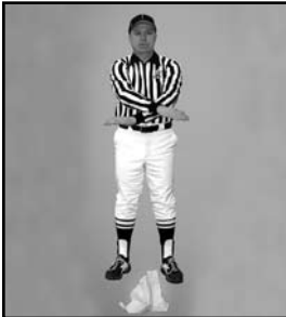
NO FLAG ON PLAY drop flag on ground & swing arms at hip level