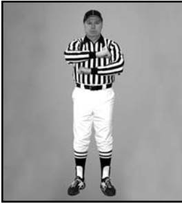
ILLEGAL PROCEDURE hands rotating in forward motion