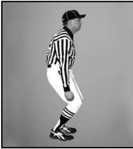
CLIPPING striking back of knees