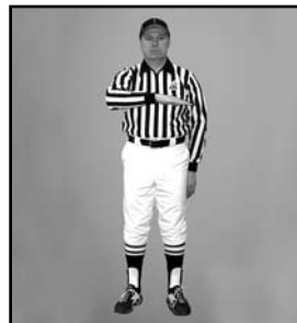
ILLEGAL PASS horizontal arc of arm