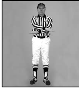
PENALTY DECLINED swinging arms at hip level