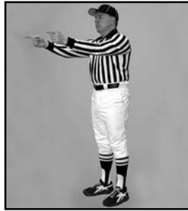
COIN TOSS WINNER pointing with both arms towards the team that won the toss