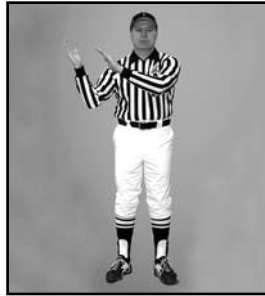
CUT OR CHOP BLOCK horizontal chopping motion