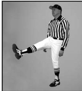
ROUGHING THE KICKER kicking motion