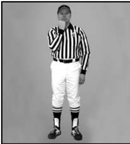
FACEMASK clenched fist at face level