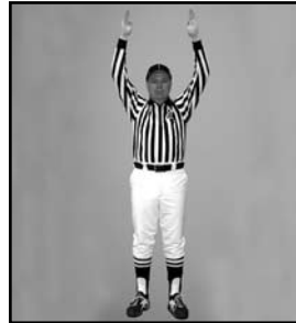
TOUCHDOWN OR FIELD GOAL both arms raised towards sky