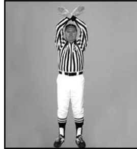
TIME OUT hands crossed above head