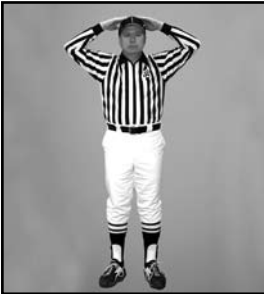
TOO MANY PLAYERS both hands on top of head