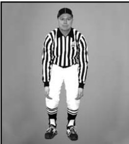
TRIPPING chopping action on both knees