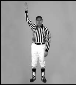
TIME IN downward rotation of arm