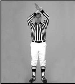
SPEARING chopping motion above head