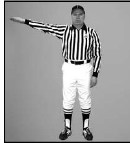
TIME COUNT VIOLATION arm extended moving in circular motion